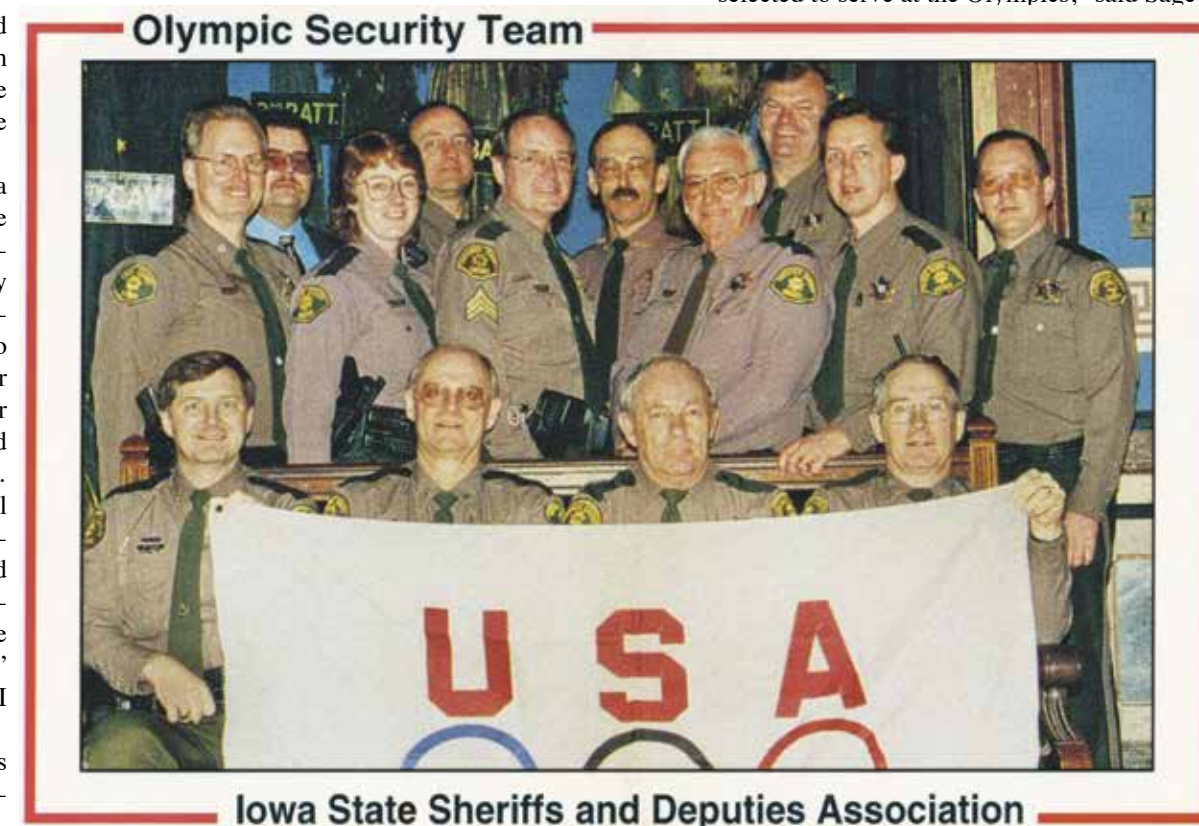
Olympic Security Team