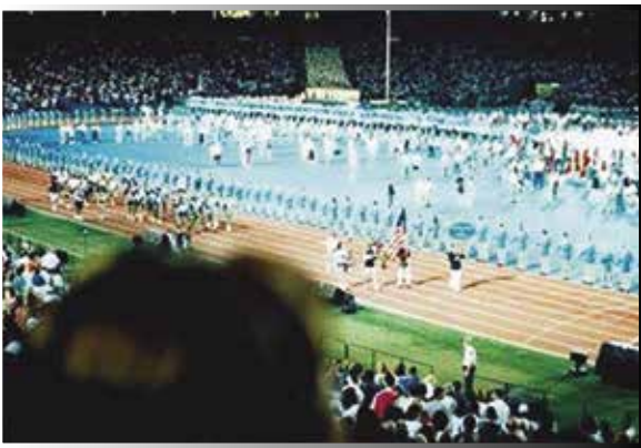
Olympic Ceremony Rehearsal