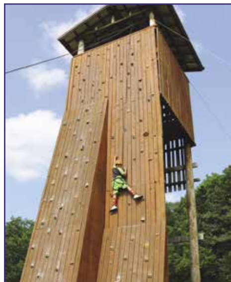
Sheriffs' and Deputies' Y-Camp 2021.