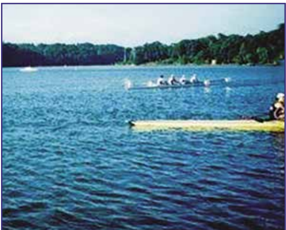
Lake Lanier was used for rowing and canoe/ kayak competitions.