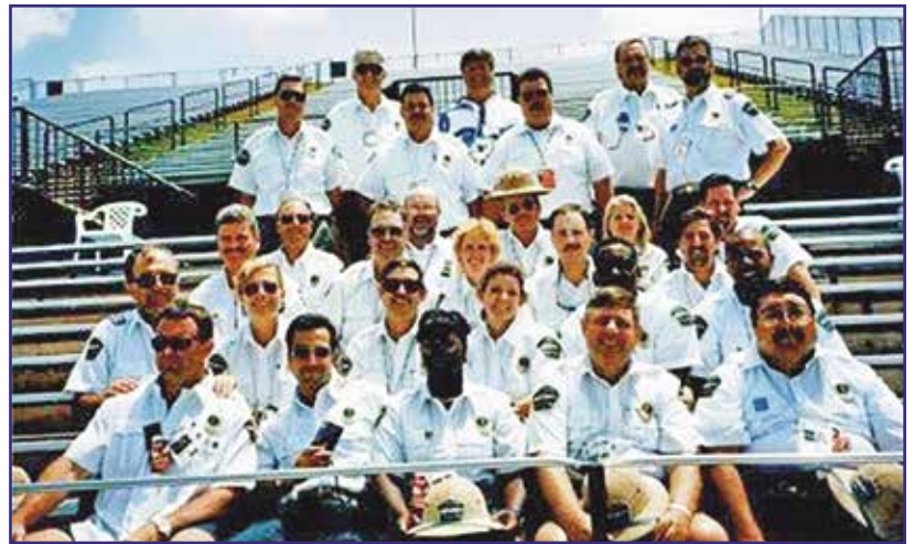
Security Team Members